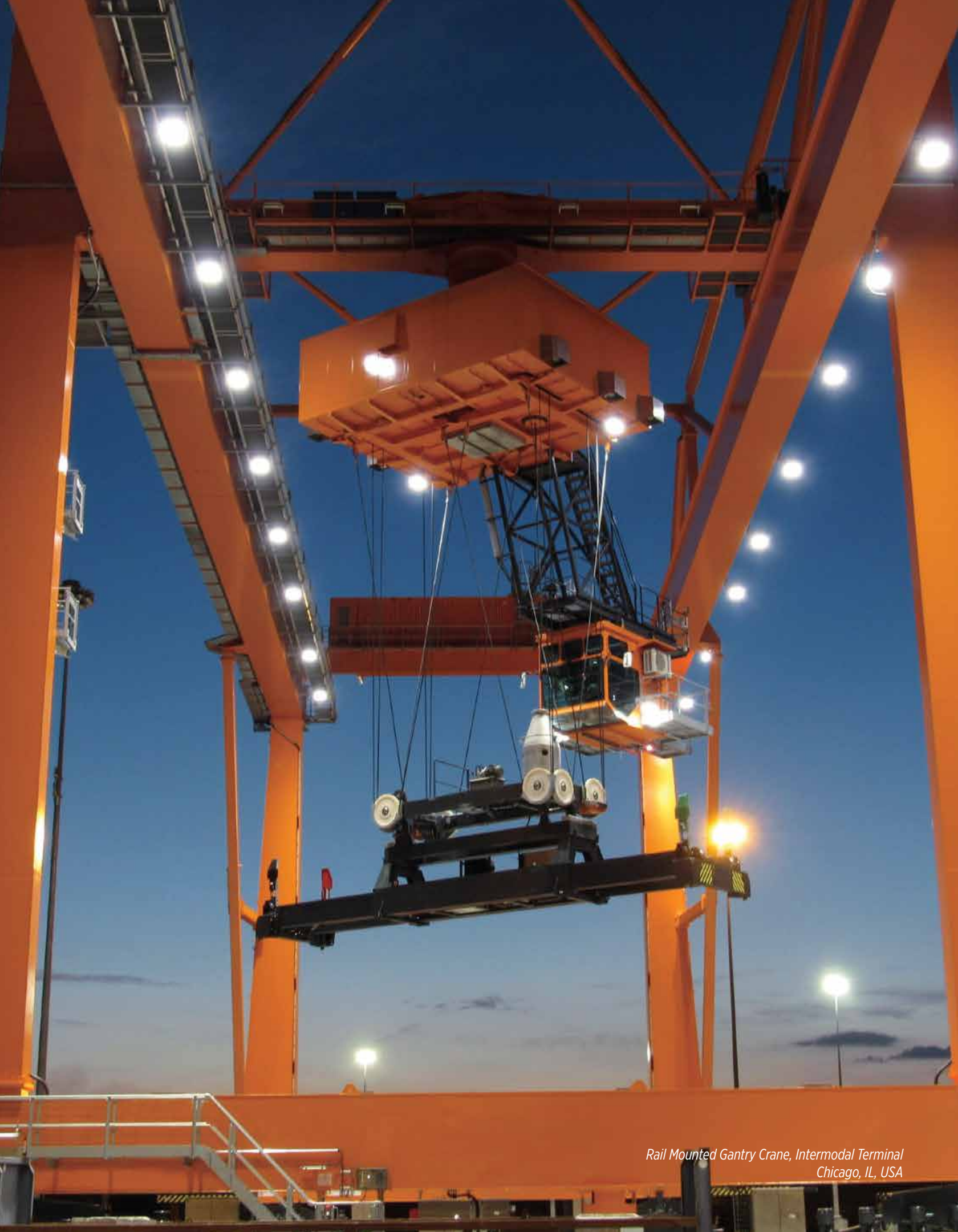
Rail Mounted Gantry Crane, Intermodal Terminal Chicago, IL, USA