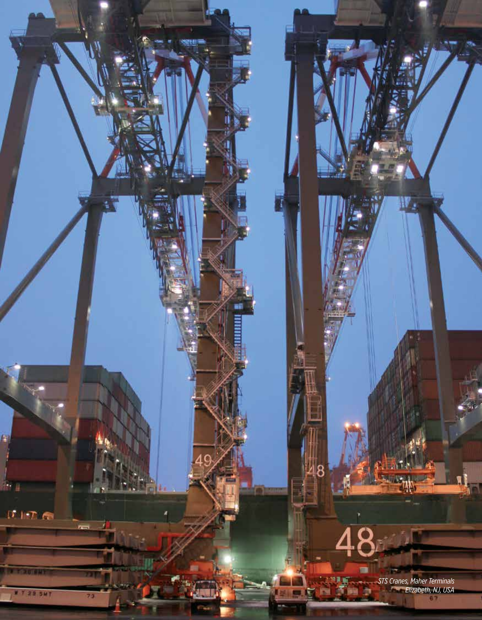
STS Cranes, Maher Terminals Elizabeth, NJ, USA